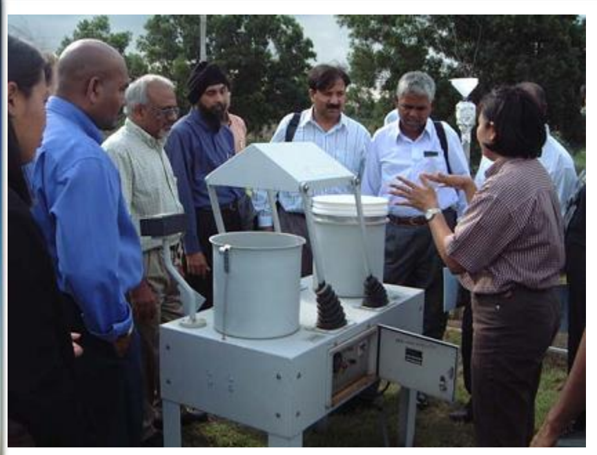
The First Regional Training Programme; March 2002, RRCAP, Bangkok